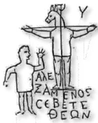
The Alexamenos Graffito, the earliest known image of Christ, in which he is depicted with Setian features.

If other religions resemble flocks of docile sheep, then Setians are like wild donkeys who refuse to be herded or domesticated. Set demands self-determination from His followers, not blind obedience! And for this reason, there is no prescribed way for Setians to believe or practice. Some are Kemetics , or Pagans who reconstruct the ancient Egyptian religion; others are Hermeticists , Gnostics , Qabalists , Thelemites , or even Chaos Magicians . Setians can combine their love for Set with any other religious tradition(s) they personally value—including Christianity!