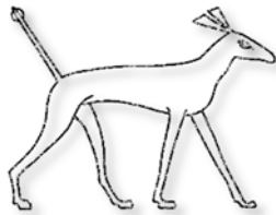
The Sha animal—the most important symbol for Set.

SETIANS are people who revere and emulate a god called SET .