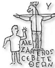
The Alexamenos Graffito, the earliest known image of Christ, in which he is depicted with Setian features.

If other religions resemble flocks of docile sheep, then Setians are like wild donkeys who refuse to be herded or domesticated. Set demands self-determination from His followers, not blind obedience! And for this reason, there is no prescribed way for Setians to believe or practice. Some are Kemetics , or Pagans who reconstruct the ancient Egyptian religion; others are Hermeticists , Gnostics , Qabalists , Thelemites , or even Chaos Magicians . Setians can combine their love for Set with any other religious tradition(s) they personally value—including Christianity!