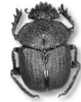
The Scarab Beetle, representing transformation, evolution, and regeneration of the soul after death.

Other faiths view humanity as mere “property” or “playthings” for the gods, but Setians believe each person is sovereign over him or herself. We do not have to accept our “Fate” or “God’s will,” for Set gives us the strength and the willpower to make our own prayers come true, as well as to forge our own destinies!